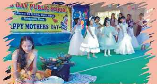
Dance performance by our pre-primary students