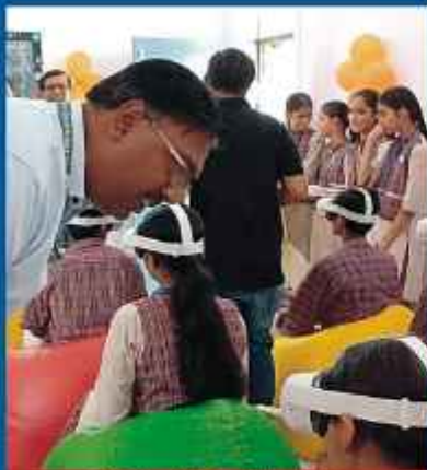
Virtual Reality Lab