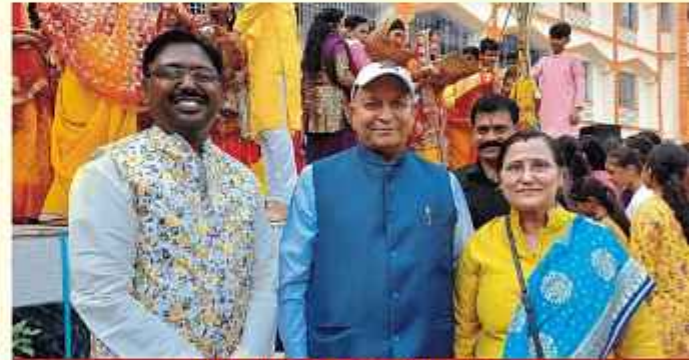
Chhath Puja Celebration