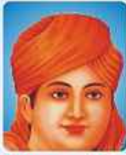
Swami Dayanand Saraswati The founder of the Arya Samaj & the great path maker of modern India