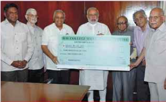
DAV- Serving our motherland

superstitions and out-dated customs like child-marriage, caste system, female foeticide, dowry, gender bias, regionalism etc;