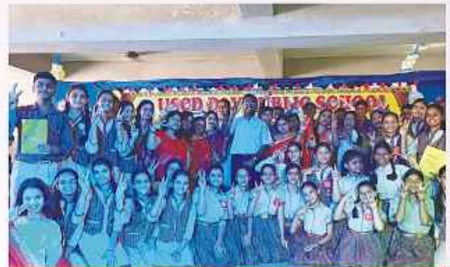
Mother's Day Celebration