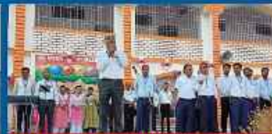
Attending Motivational Speeches