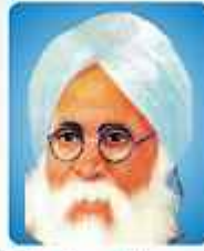
Mahatma Hansraj Fulfilled his pledge of 25 years of honorary service as the Principal of First D.A.V. College at Lahore