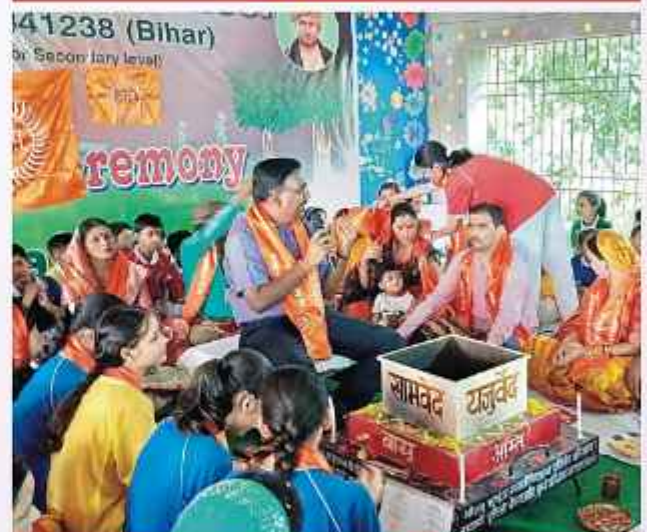
Weekly Hawan with Parents