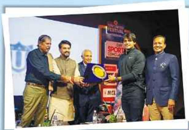
Niraj Chopra, Olympic Gold Medalist an alumnus of DAV being awarded by President DAV CMC & other alumni of DAV