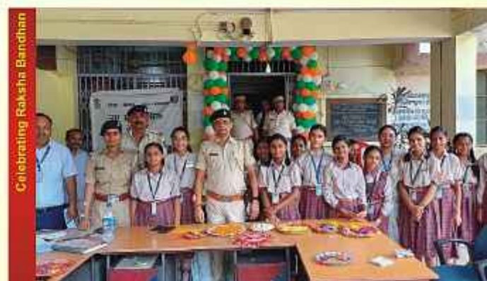
Celebrating Raksha Bandhan